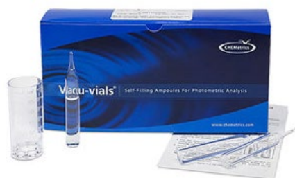
Fig. 1 CHEMetrics Vacu-vials Kit

CHEMetrics Vacu-vials kit shown in Fig.1 was used for this analysis. It is a simple and convenient method which allows for colorimetric determination of analytes without tedious reagent preparations. Each chromate Vacu-vials test kit includes 30 vacuum-sealed testing ampoules, an A-2800 Acidifier Solution, a 25 mL sample cup, an ampoule blank, and instructions. Each testing ampoule contains a unit dose of pre-formulated diphenylcarbazide reagent, which selectively reacts with Cr(VI) in the acidified water sample to form a red-violet colored complex. The concentration of the complex formed is directly proportional to the Cr(VI) concentration. During analysis, the tip of the ampoule is snapped off in the sample solution to draw it into the ampoule. After the chromogenic reaction is completed, the sample-reagent mixture is then directly measured in the ampoule.