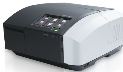
Fig. 2 UV-1900i UV-VIS spectrophotometer

The UV-1900i UV-VIS spectrophotometer (Fig. 2) was used for photometric measurement. Before sample measurement, the ampoule blank was used to auto-zero the instrument. Table 1 lists the instrument and analytical conditions.