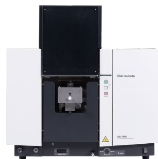
AA-7800F Flame Model

AA-7800 series spectrophotometers can be upgraded with additional units to evolve the system according to what is analyzed.