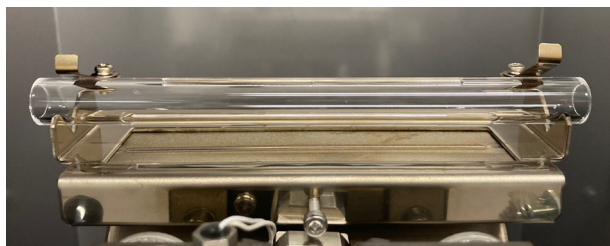
Fig. 1 Atom Booster

The atom booster is a quartz tube with an overall length of about 15 cm that has vertical slits at the top and bottom. (The lower slit is 100 mm long and the upper slit is 80 mm long.) The upper slit is shorter than the lower slit, so atoms stay longer in the flame. That increases the density of atomized elements, leading to improved absorbance. It is especially effective for elements that atomize at relatively low temperatures (Cd, Pb, Cu, etc.).